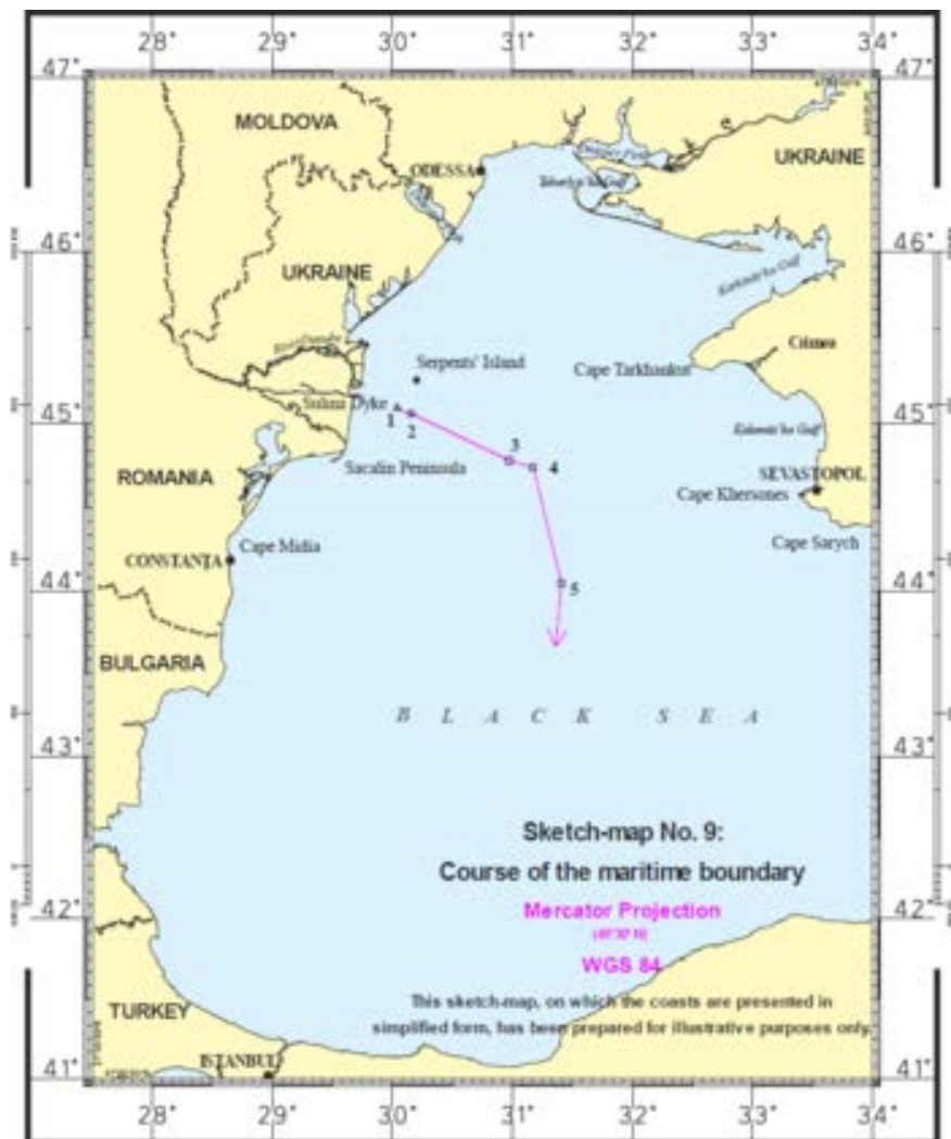
Figure 3: Boundary determined by the ICJ.

areas falling to the parties (1:2.1) was not significant enough to require adjustment.