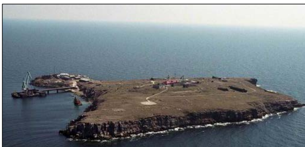
Figure 1: Serpent Island (Black Sea)

The presence of Serpent Island (also known as Snake Island 2 ), a small and sparsely inhabited island depicted in Figure 1 that is situated in the northwestern part of the Black Sea, approximately